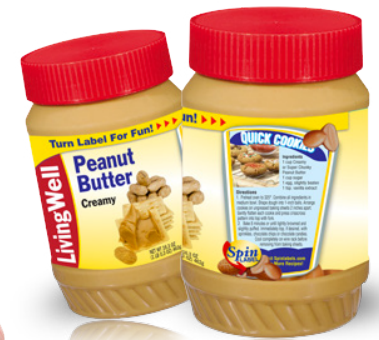
CUT AND STACK