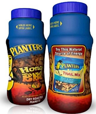
FULL BODY SHRINK SLEEVE