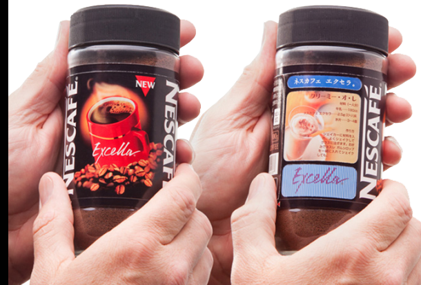
2-PLY PRESSURE SENSITIVE